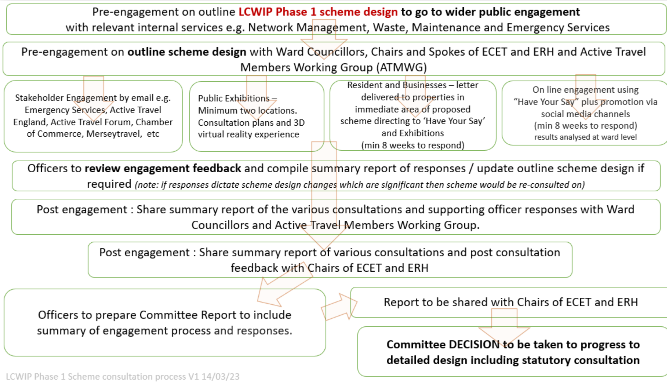
Appendix D – LCWIP Phase 1 Statutory Processes Flow Chart